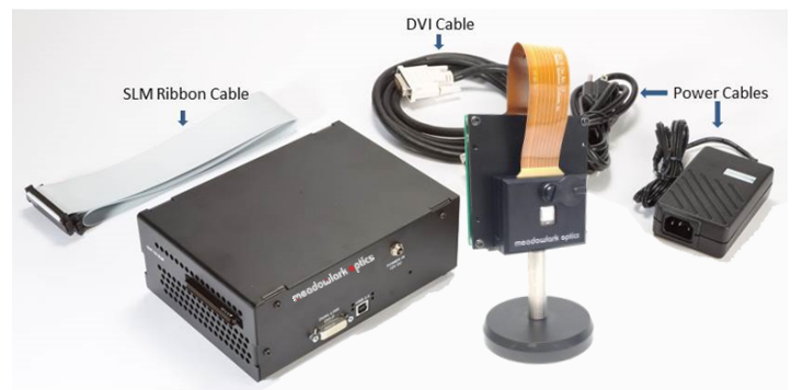
E512 LCoS SLM System Contents

16-bit images can be transferred across the DVI interface at a rate supported by the graphics card used (60 – 200 Hz). With 16-bits of analog voltage resolution, the SLM can be used to easily obtain more than 1000 linear resolvable phase levels. This \lambda/1000 phase resolution can be maintained over a broad wavelength range by tuning the look-up-tables / calibrations for your incident wavelength.